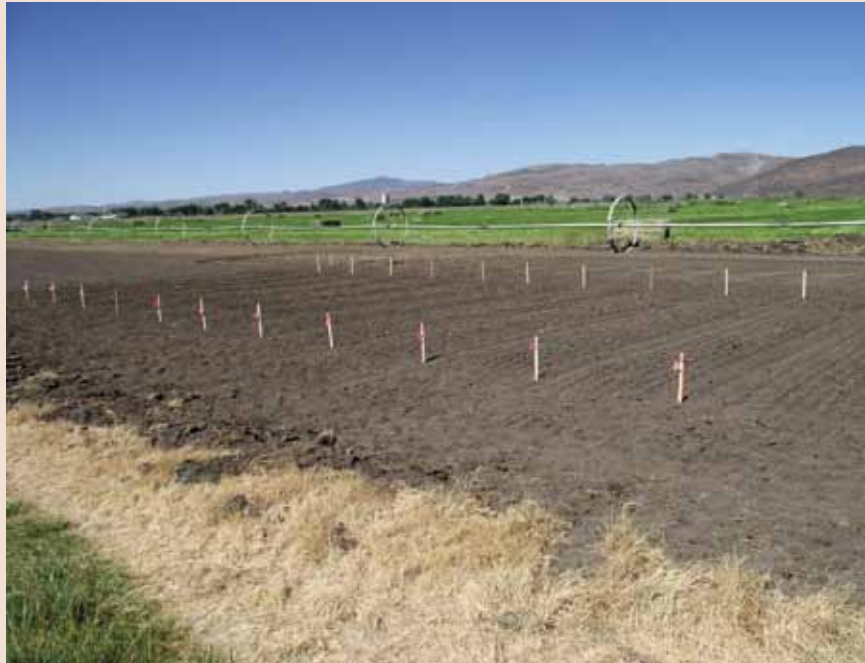
Seeds for the alternative crop camelina were planted at the University’s Nevada Agricultural Experiment Station Main Station Field Lab for small-scale testing before being considered for commercial use.