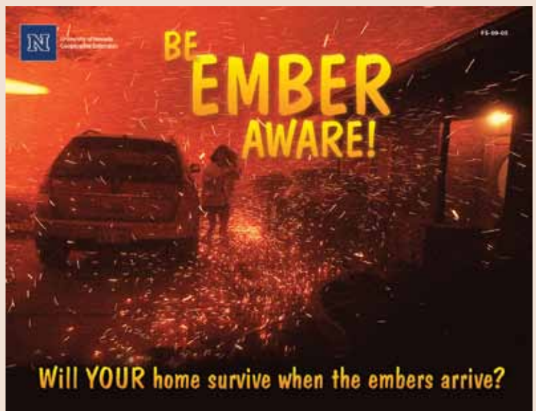
“Be Ember Aware!” is Living With Fire’s most popular publication.

Program Partners: Bureau of Land Management; Nevada Division of Forestry; U.S. Forest Service; Nevada State Fire Marshal Division; local, state and federal firefighting agencies; public safety agencies; community organizations; local businesses