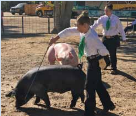
The curriculum teaches youth to raise quality swine, beef and dairy cattle, sheep, goats, dairy goats, rabbits and poultry.

4,814 youth across 28 states have been certified through the program