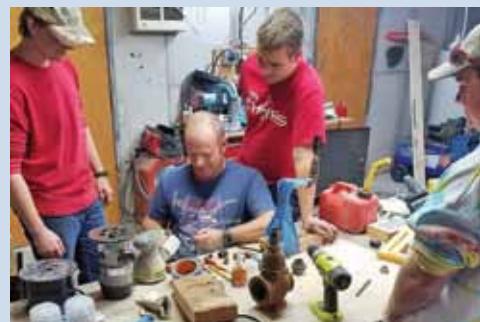
STEM (Science, Technology, Engineering and Math) and workforce training is part of the Lincoln County Workforce Development Program for young adults.

Program Partners: Workforce Connections; Lincoln County School District; Lincoln County Regional Development Authority; Lincoln County Government; Lincoln County Authority on Tourism; City of Caliente; Nevada Department of Employment, Training and Rehabilitation; U.S. Department of Labor