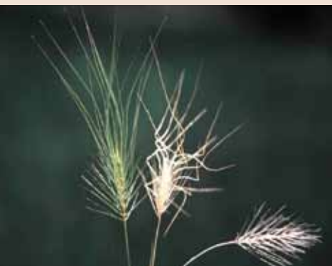
By having cattle graze cheatgrass and medusahead in the fall and winter, researchers hope to reduce the risk of wildfire in future years.