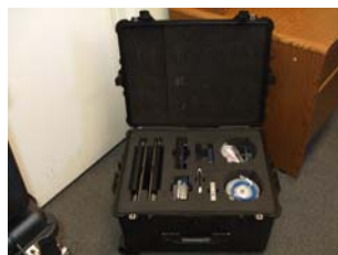
MTL Set A- Case 1 Exterior view,