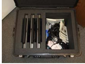
MTL Case B Interior View Three Laptop Computers, Power Supplies, etc.