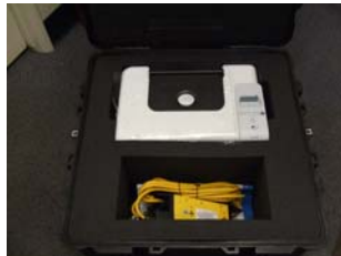
MTL Case C Interior View, Laser Printer, Power Cords, etc.