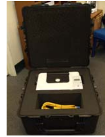
MTL Case C Exterior View