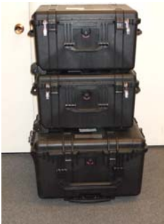
MTL Set A Cases 1 2, and 3 in shipping Configuration

All hardware components are color-coded to the specific storage container. This makes for easier inventory and more efficient unpacking and repacking.