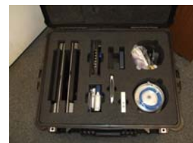
MTL Set A-Case 1, Interior View, 2 Laptops one Video camera, one still camera